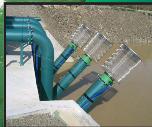
Rotating Screen Reduces Clogging

LAKOS Separators and Filtration Solutions